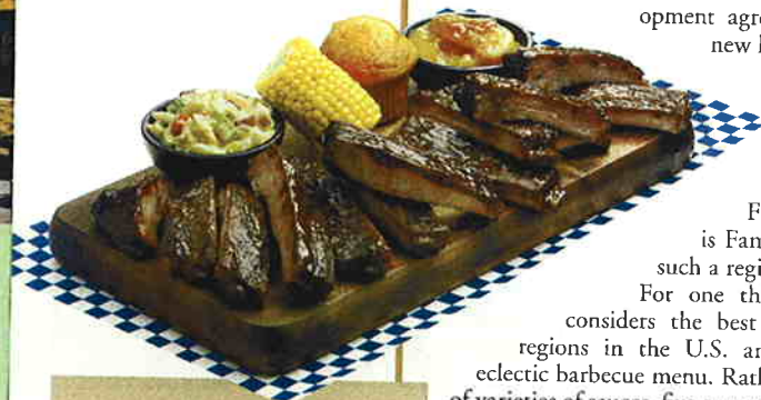
Famous Dave's provides the ribs, you add the sauce.

"A typical traveling group assisting us in developing a new sauce usually consists of a couple R & D