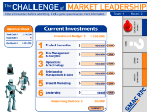
GMAC-RFC Simulation: The Challenge of Market Leadership